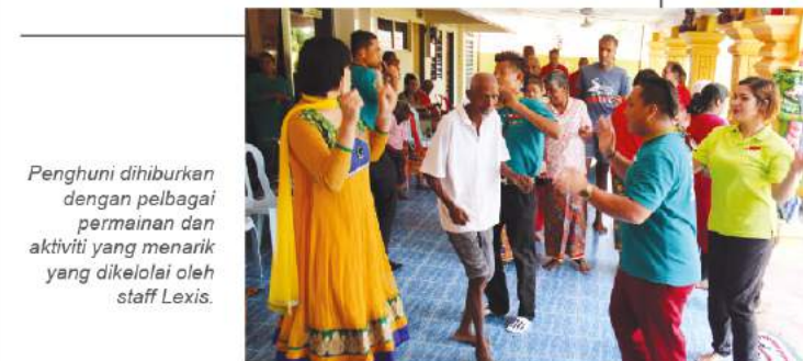
Penghuni dihiburkan dengan pelbagai permainan dan aktiviti yang menarik yang dikelolai oleh staff Lexis.