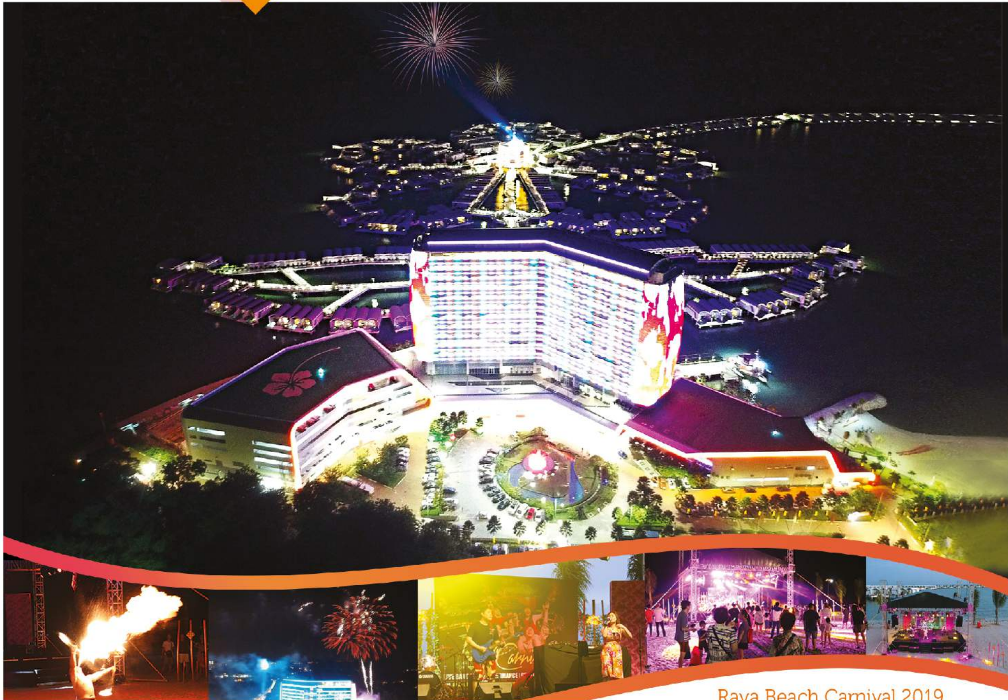
Raya Beach Carnival 2019