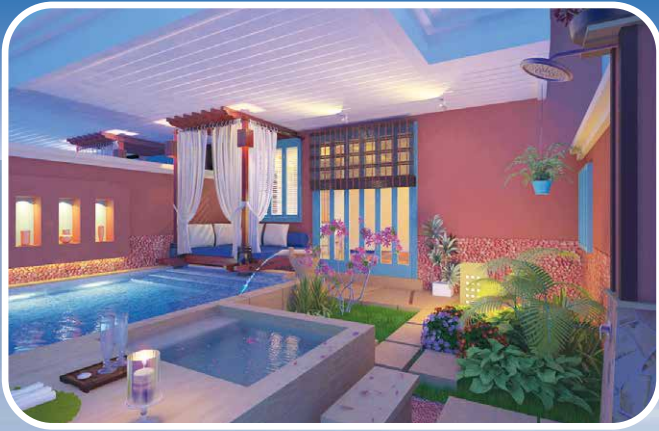
Signature amenities complete with private pool, open-air shower, landscaped indoor garden and sun lounges

Nestled in the historically rich, colorful and awe-inspiring State of Malacca is the latest water homes project of KL Metro Group ~ The Hibiscus. This uniquely designed resort resonating great beauty and peacefulness is set to be the next landmark of Malacca, a work of art that portrays an exquisite and sensual statement.