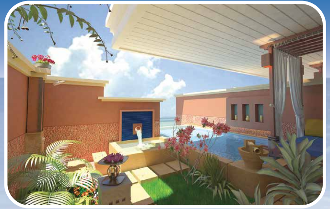
Sophisticated Zen-like design creates a peaceful haven for relaxation and intimacy