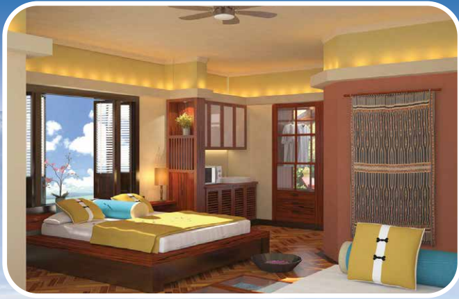
Artistically decorated with quality materials and finishes