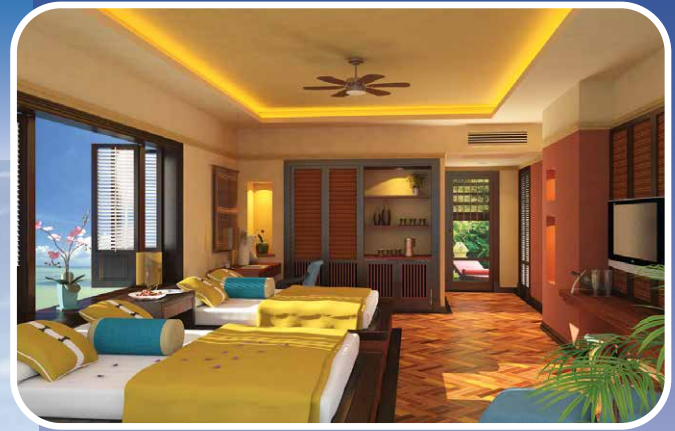
Cosy living area opens to the many splendors of the Straits of Malacca