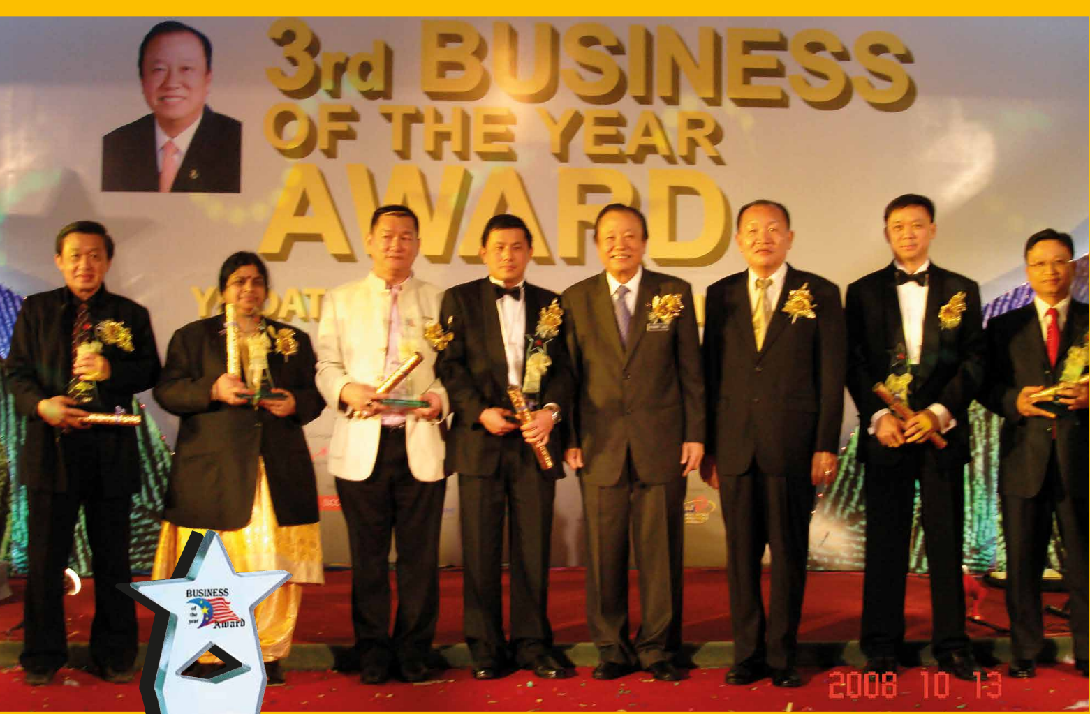
Gala award presentation of the 3rd Malaysia Business of The Year Award on 13th October 2008 at Istana Hotel , Kuala Lumpur

A moment of pride and joy for Kuala Lumpur Metro Group for winning the 3rd Malaysia Business of The Year Award ( Emerging Entrepreneur of the Year 2008 ) , in recognition of its outstanding performance.