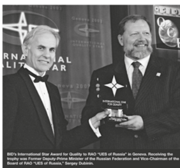
BID's International Star Award for Quality to RAO "UES of Russia" in Geneva. Receiving the trophy was Former Deputy-Prime Minister of the Russian Federation and Vice-Chairman of the Board of RAO "UES of Russia," Sergey Dubinin.

RAO UES of Russia received the International Star Award for Quality through former Minister of Finance of Russia, Sergey Dubinin