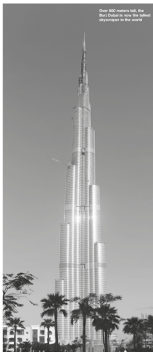
Over 800 meters tall, the Burj Dubai is now the tallest skyscraper in the world

American company has led the construction of many famous buildings, such as the United Nations Secretariat in New York, the United Airlines Terminal 1, the Madison Square Garden, the American Stock Exchange and the Rose Garden Arena. It is not surprising that Turner has been granted prestigious