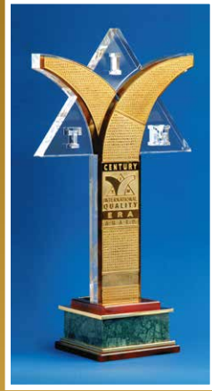
Century International Quality Gold ERA ( Geneva ) 2011