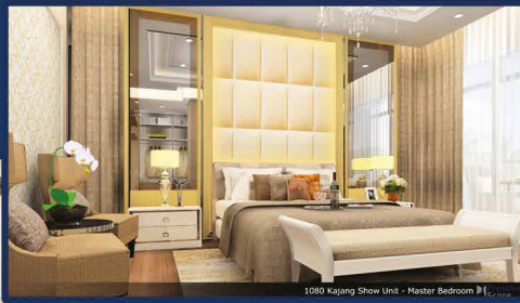
1080 Kajang Show Unit - Master Bedroom