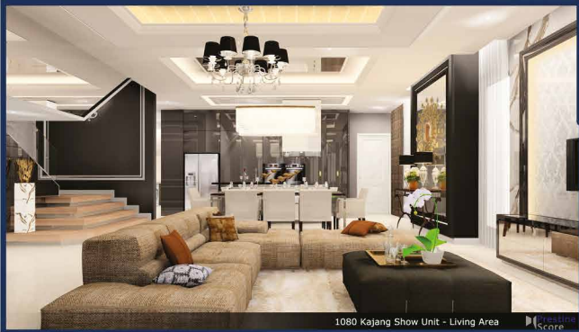
1080 Kajang Show Unit - Living Area