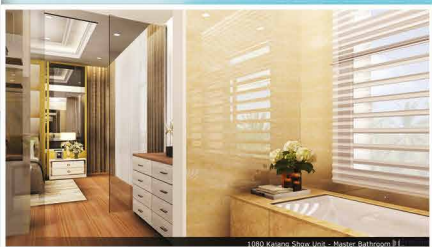
1080 Kajang Show Unit - Master Bathroom