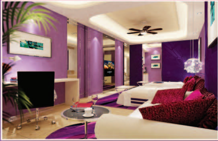
Type X : 960 - 1030 sq ft ( 89 - 96 sq m )

Situated onshore, Type X and Type Y villas offer more spacious area, but yet sharing the same modern contemporary style of the other types. The unit's brighter tone and sleek furnishing truly enriches and dignifies its aesthetic quality and effect. Apart from a wide view of the beautiful waterfront, its functional layout, impeccable finishing and space optimization create a succinct visual appeal that is contemporary yet timeless and lasting.