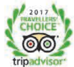
Tripadvisor Award M.A., USA 2017