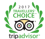
Tripadvisor Award M.A., USA 2017