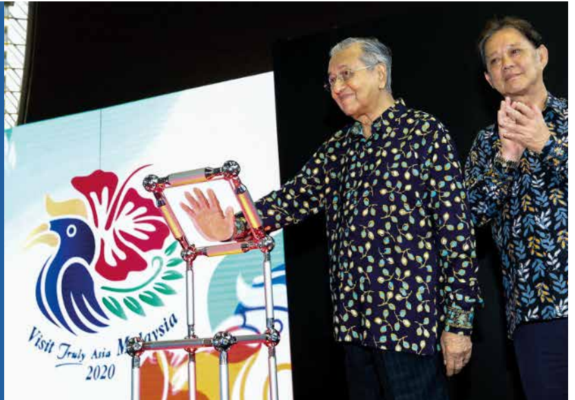
Tun Dr Mahathir Mohamad together with Tourism Minister Datuk Mohammadin Ketapi during the unveiling of the new Visit Malaysia 2020 logo at KLIA, Sepang July 22, 2019.

In 2018, 25.8 million tourists visited the country, and Malaysia secured 15th place among countries with the highest number of tourist arrivals.