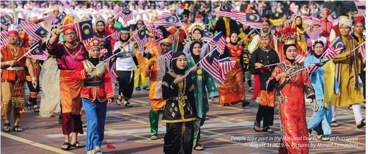
People take part in the National Day Parade at Putrajaya August 31, 2019.

https://www.malaymail.com : 31st August 2019