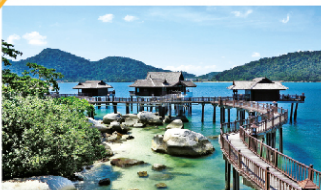
Pangkor Laut Resort, Perak