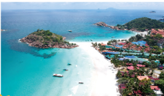
Redang, Kuala Terengganu