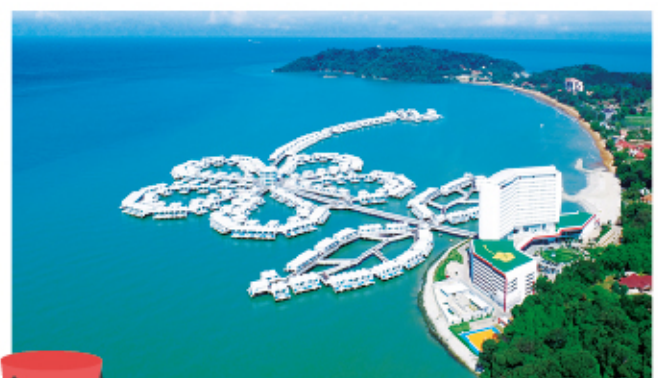
Lexis Hibiscus, Port Dickson