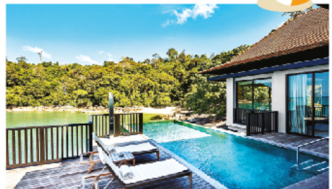
The Ritz-Carlton, Langkawi