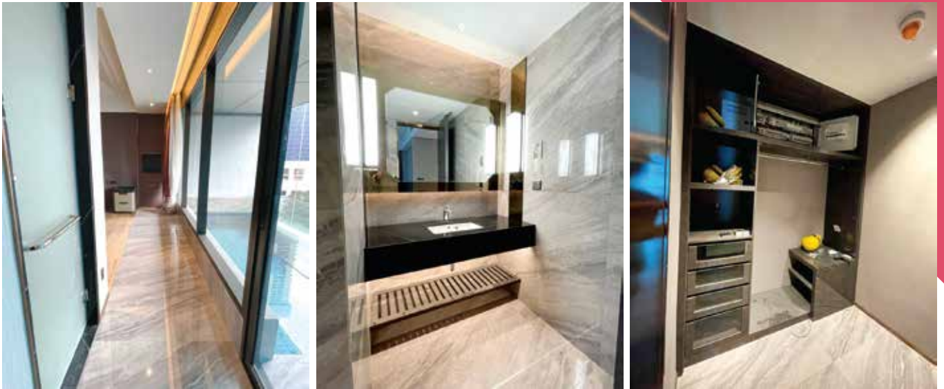
Renovation works in progress 装修工程正在进行中