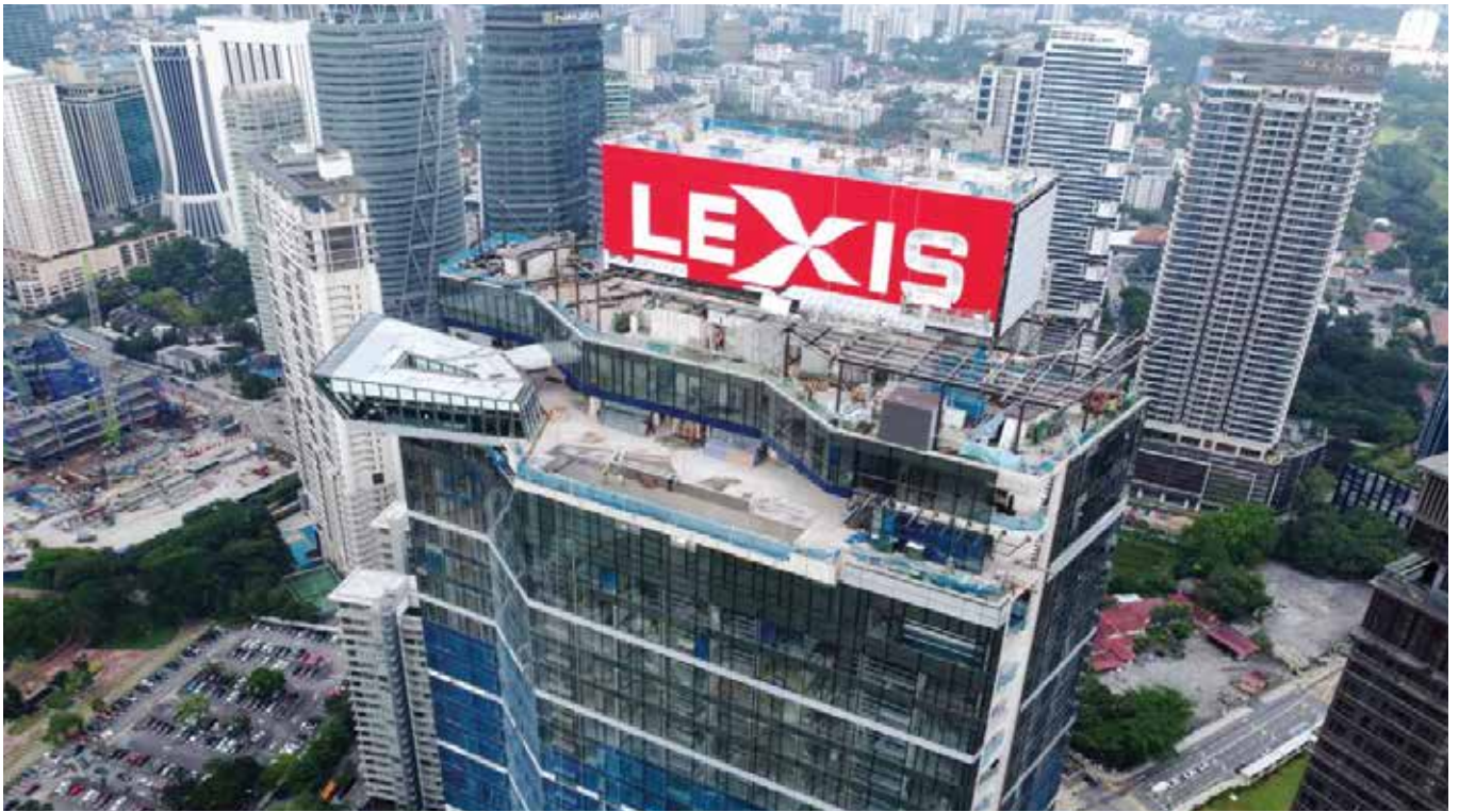
Construction in Good Progress 建设进展顺利